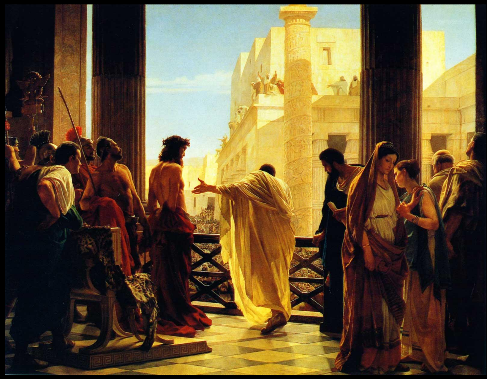
Antonio Ciseri "Ecce Homo" (John 19:5)